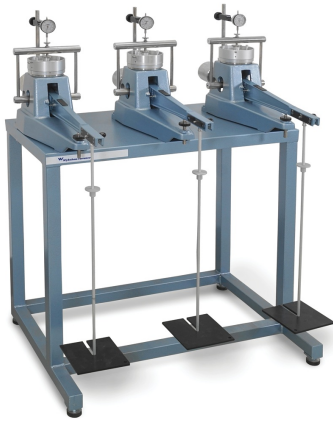
Three front loading oedometers (26-WF0302) fitted on consolidation bench (26-WF0312), complete with consolidation cells, dial gauges (26-WF6401).