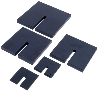
Slotted steel weights