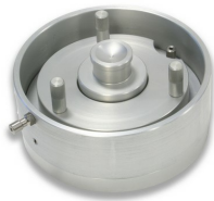
Consolidation cell, suitable for incremental loading test, swelling and permeability tests